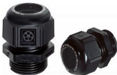
SKINTOP® K-M ATEX plus