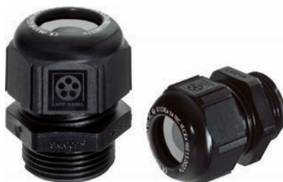
SKINTOP® KR-M ATEX plus