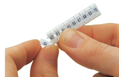
Separating an individual marker from the WMB marker strip – for larger terminal blocks.