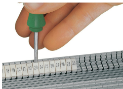
Snapping a WMB marker strip into the marker slot of the double marker carrier.