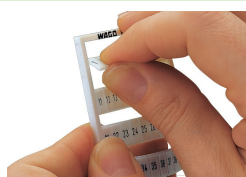
Separating a strip from the WMB or WMB marker card.